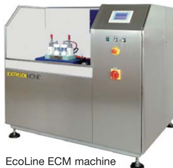
EcoLine ECM machine